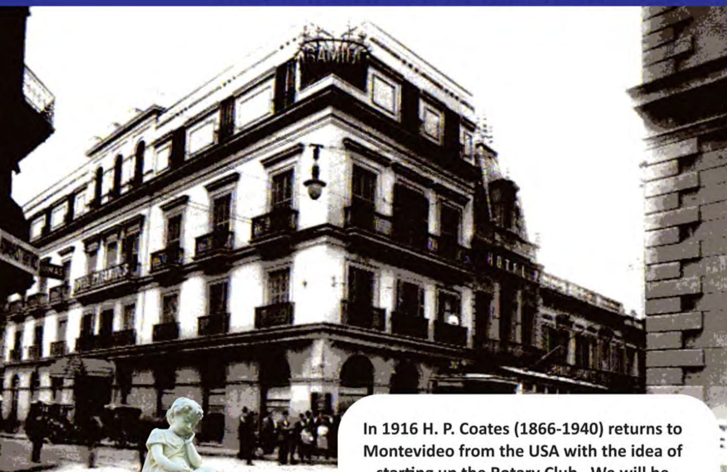
SARANDÍ & ITUZAINGÓ CORNER, FIRST PLACE OF ROTARY CLUB AT 1918.

Friday 19 th . August 19:00 hrs At the Chapel.