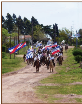
San Jorge, left; River Plate, right

The Battle of the River Plate. The 70th anniversary of the Battle of the River Plate on Sunday 13 December 2009 was commemorated with a special service at the Holy Trinity Cathedral followed by drinks at the Ambassador's residence. Members of the British Community were invited along with Uruguayan authorities and the captain and crew of HMS Scott.